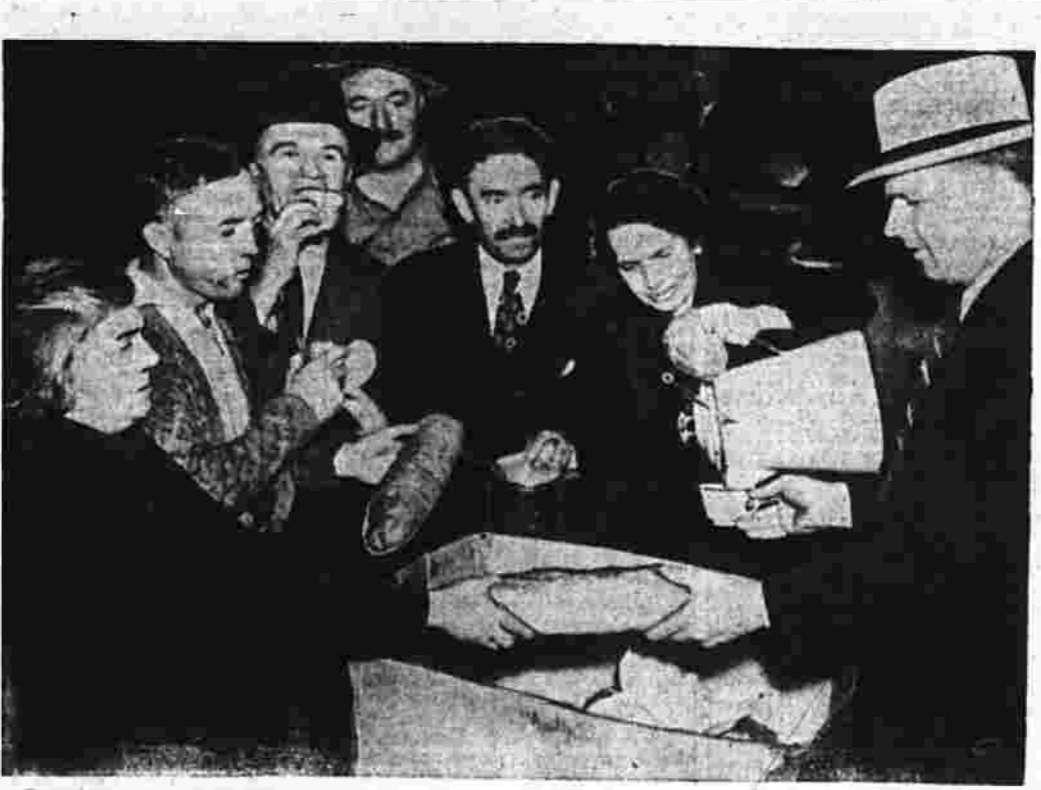
Carrying out a threat made many times during Cleveland's recurring relief crises, 150 demonstrators sat today in protest against work-to-work handling of relief problems with stop-gap methods.